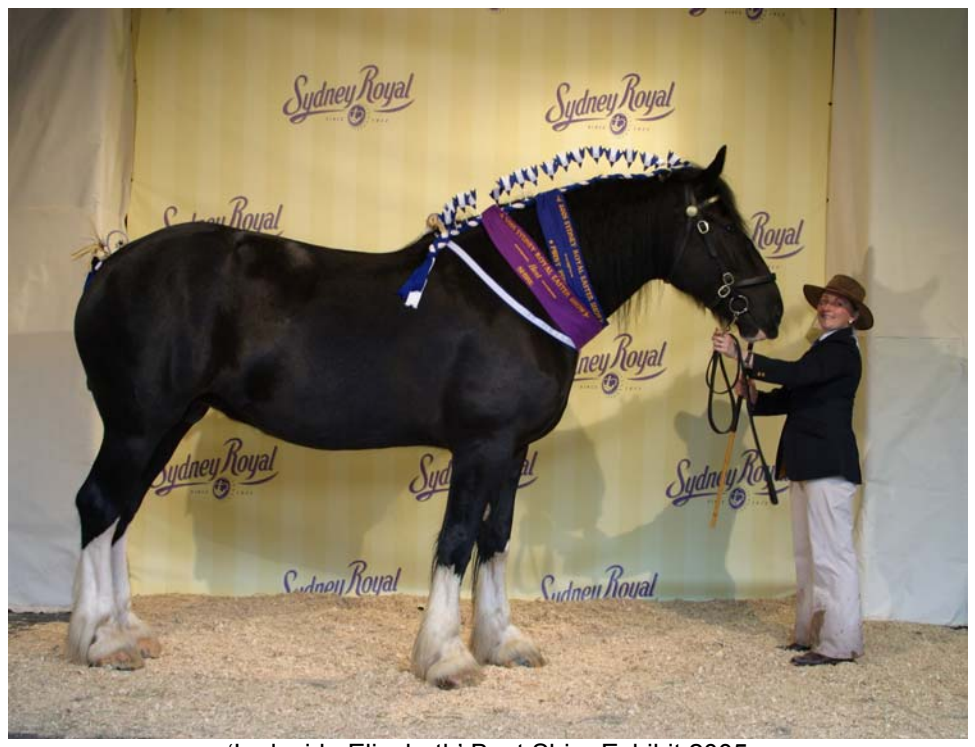
'Ingleside Elizabeth' Best Shire Exhibit 2005